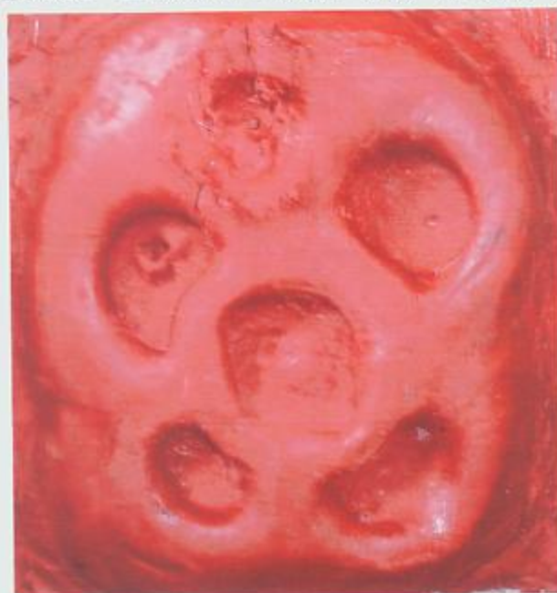
Figure 2 Deformation shape on the artificial body